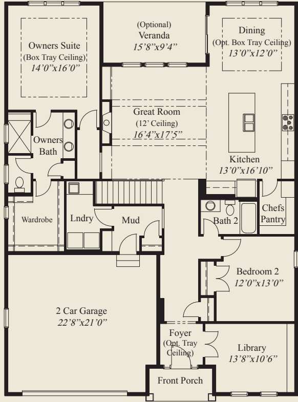
FIRST FLOOR 2,000 SQ.FT.

© Romanelli & Hughes Building Co. All home plans presented on this brochure are protected by copyright. Reproduction either in whole or in part without written permission is strictly prohibited. All renderings and floor plans are artists' conceptions and are not intended to be an actual depiction of the home or its surroundings.