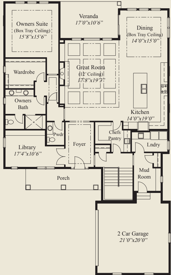
FIRST FLOOR 2,265 SQ.FT.