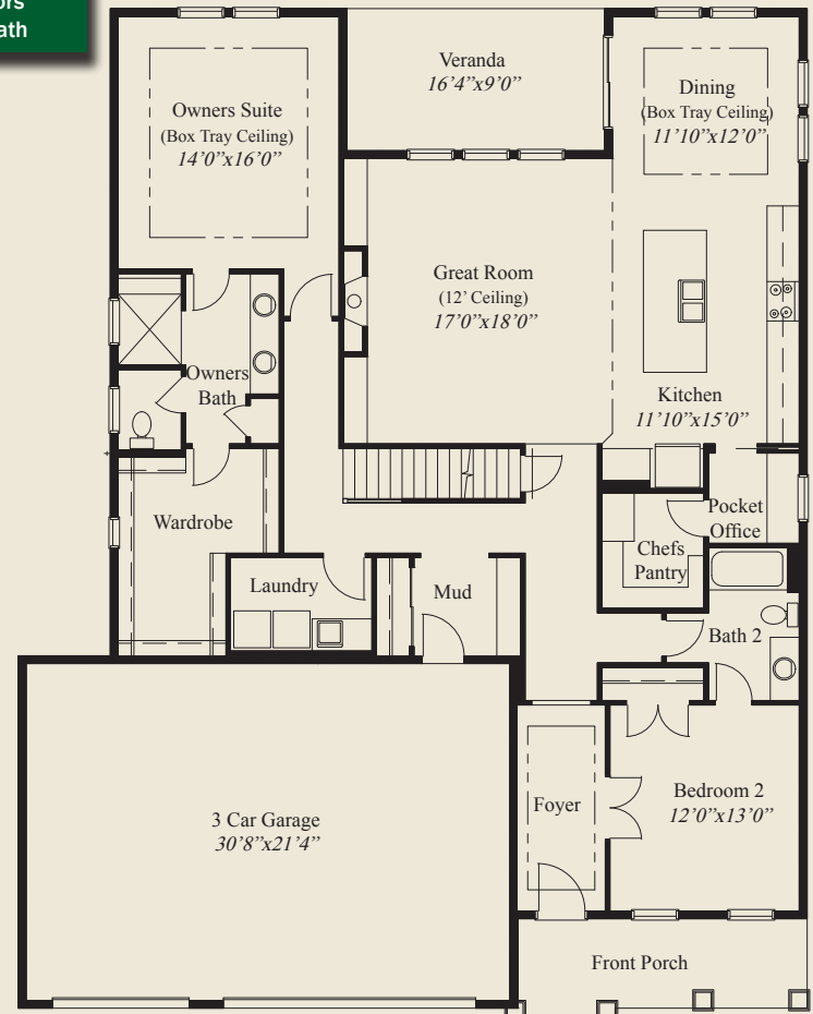
FIRST FLOOR 1,990 SQ.FT.

© Romanelli & Hughes Building Co. All home plans present on this brochure are protected by copyright. Reproduction either in whole or in part without written permission is strictly prohibited. All renderings and floor plans are artists' conceptions and are not intended to be an actual depiction of the home or its surroundings.