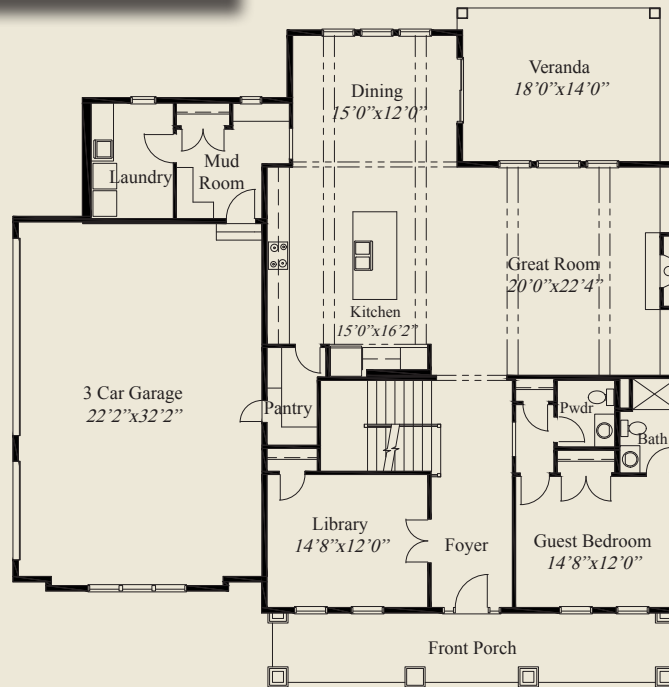
FIRST FLOOR 1,971 SQ.FT.