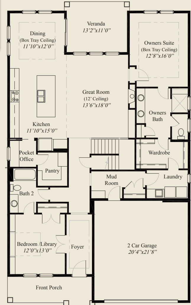
FIRST FLOOR 1,827 SQ.FT.

© Romanelli & Hughes Building Co. All home plans present on this brochure are protected by copyright. Reproduction either in whole or in part without written permission is strictly prohibited. All renderings and floor plans are artists' conceptions and are not intended to be an actual depiction of the home or its surroundings.