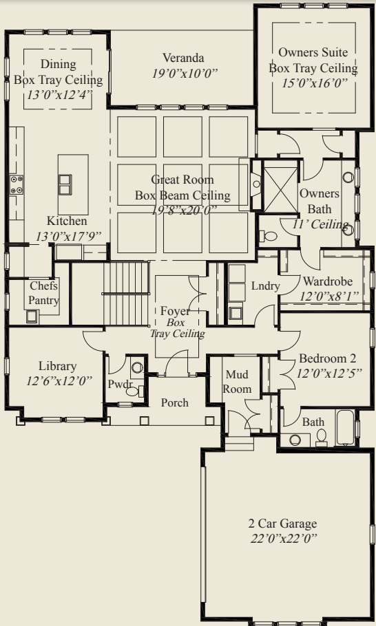
FIRST FLOOR 2,377 SQ.FT.