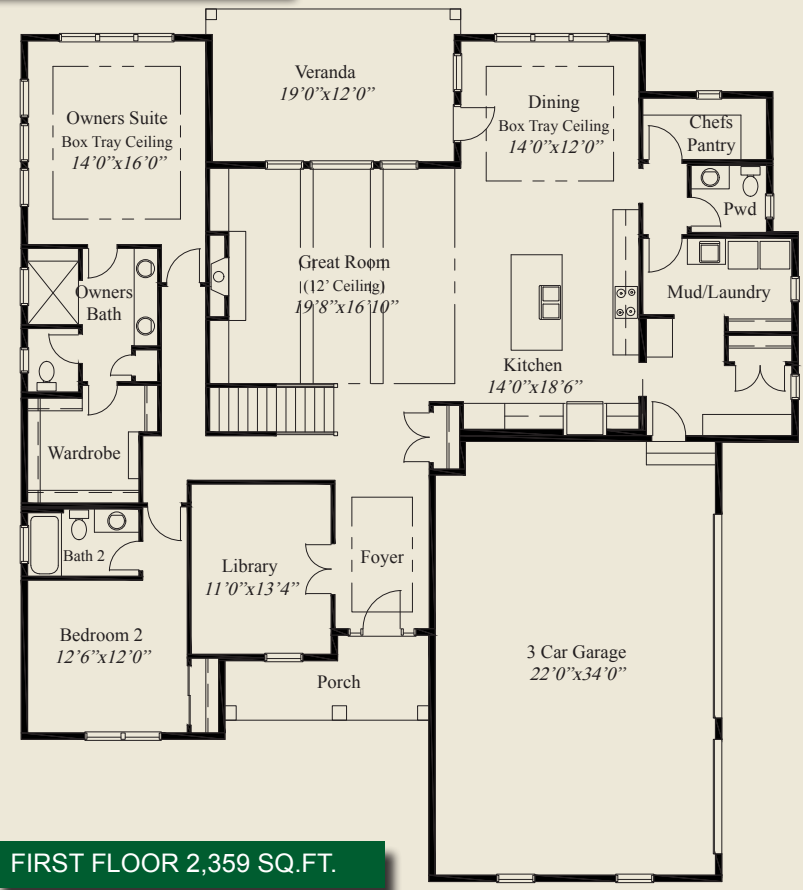
FIRST FLOOR 2,359 SQ.FT.