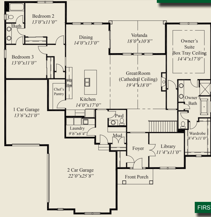
FIRST FLOOR 2,515 SQ.FT.