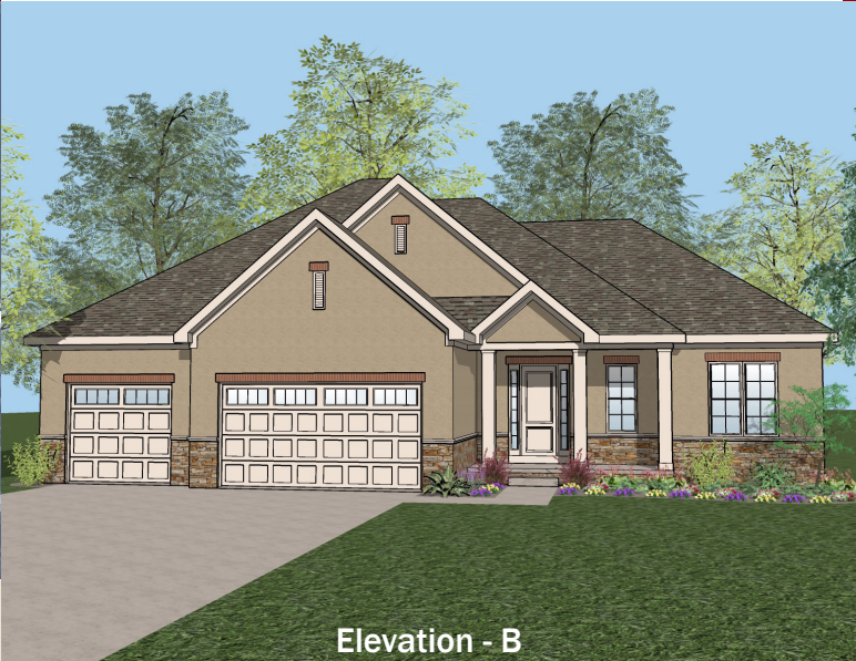
Elevation - B