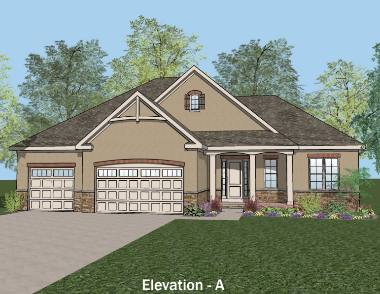
Elevation - A