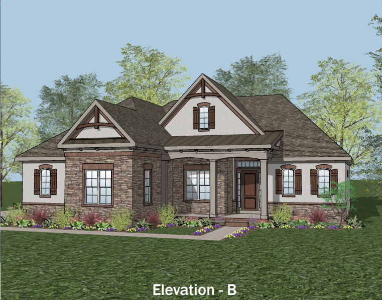
Elevation - B