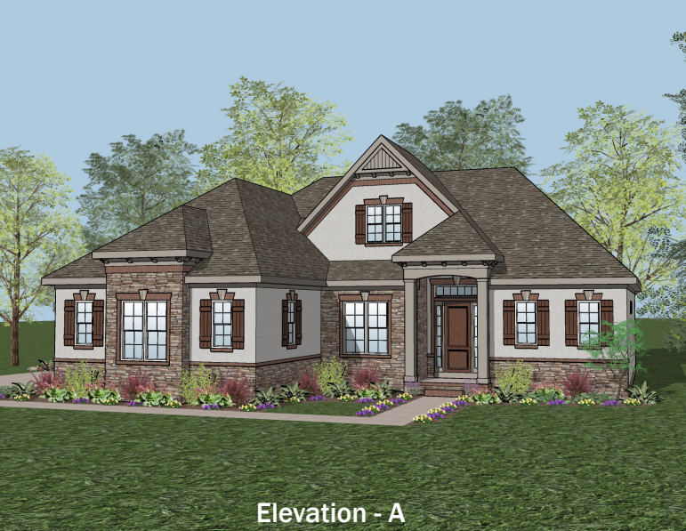
Elevation - A