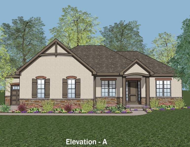
Elevation - A