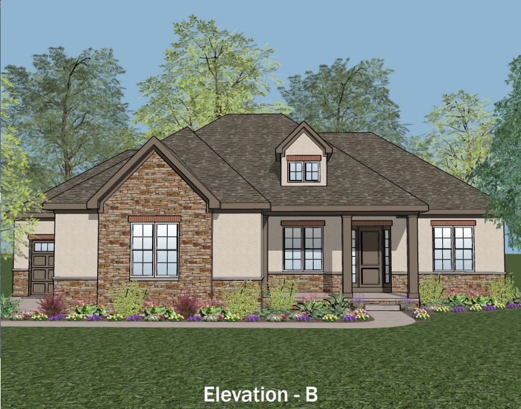
Elevation - B