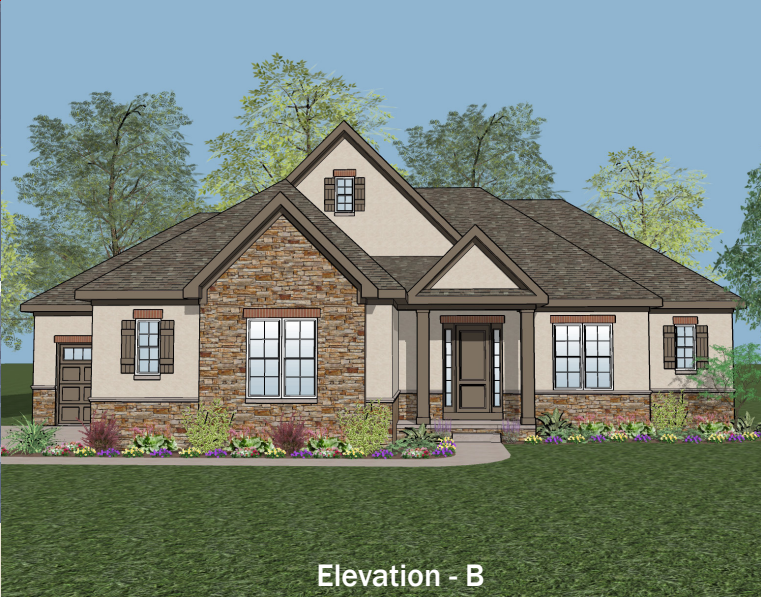
Elevation - B