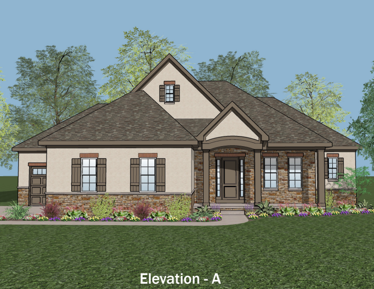
Elevation - A