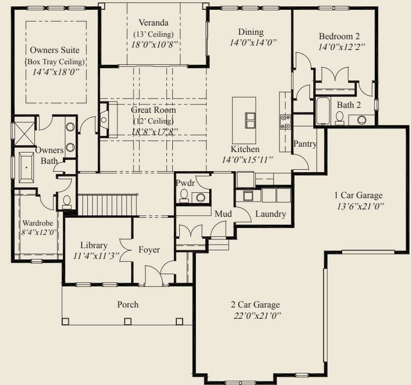
FIRST FLOOR 2,291 SQ.FT.