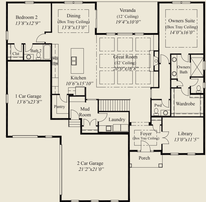
FIRST FLOOR 2,241 SQ.FT.

© Romanelli & Hughes Building Co. All home plans present on this brochure are protected by copyright. Reproduction either in whole or in part without written permission is strictly prohibited. All renderings and floor plans are artists' conceptions and are not intended to be an actual depiction of the home or its surroundings.