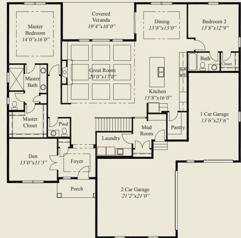
FIRST FLOOR 2,241 SQ.FT.

© Romanelli & Hughes Building Co. All home plans present on this brochure are protected by copyright. Reproduction either in whole or in part without written permission is strictly prohibited. All renderings and floor plans are artists' conceptions and are not intended to be an actual depiction of the home or its surroundings.