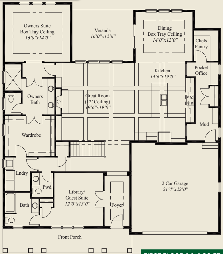
FIRST FLOOR 2,213 SQ.FT.