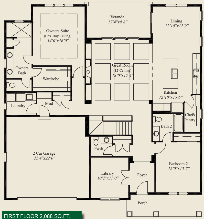
FIRST FLOOR 2,088 SQ.FT.