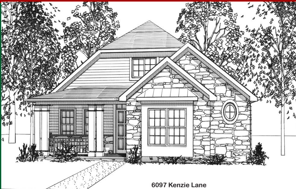
6097 Kenzie Lane