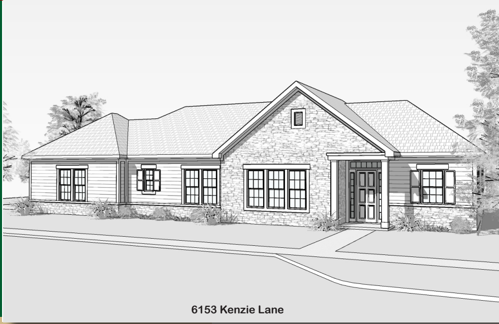
6153 Kenzie Lane