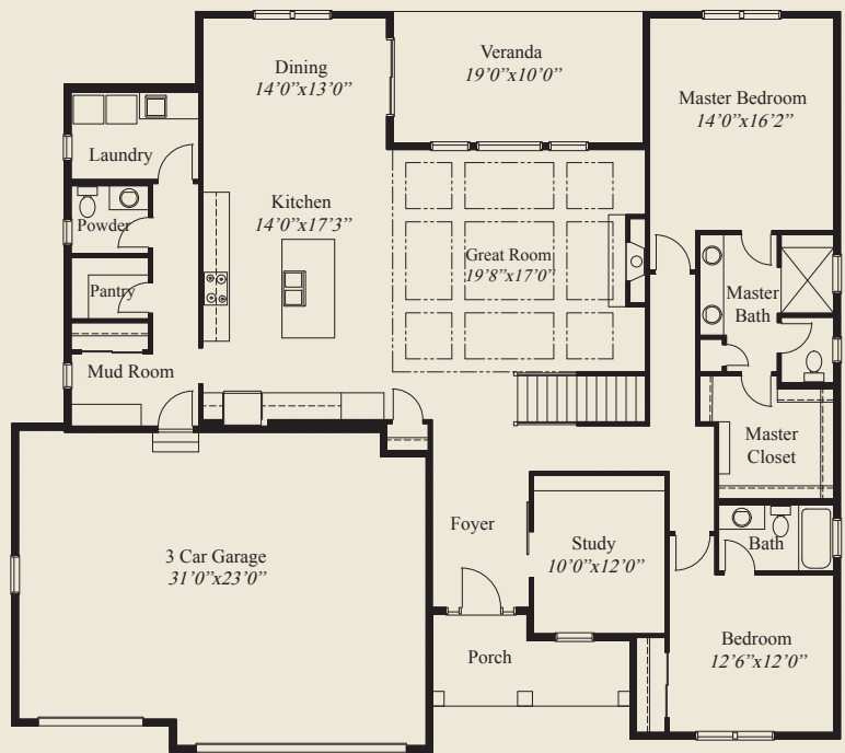
FIRST FLOOR 2,253 SQ.FT.

© Romanelli & Hughes Building Co. All home plans present on this brochure are protected by copyright. Reproduction either in whole or in part without written permission is strictly prohibited. All renderings and floor plans are artists' conceptions and are not intended to be an actual depiction of the home or its surroundings.